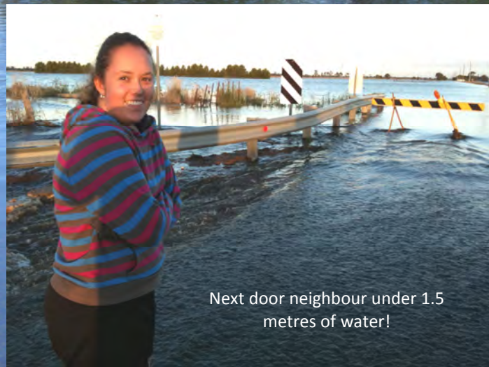
Next door neighbour under 1.5 metres of water!