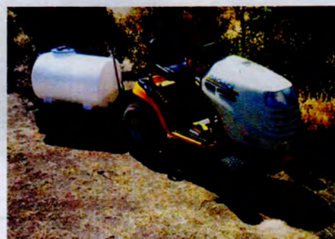
Our tree watering setup

Like most people we are getting good value out of our bath water, using it to water trees and plants.