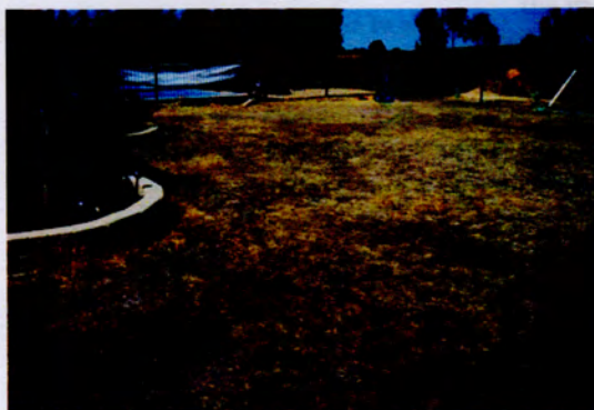
Front 'lawn' looking very nice