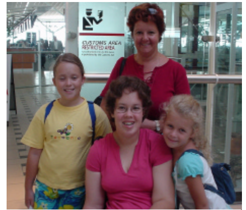
Girls at Brisbane Airport

We arrived back in Brisbane on 20 March. I departed for the new job on the next day.